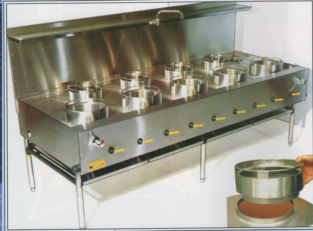
本公司天府牌 SUPACOOK 水爐頭經嚴格監製。第一家始創無焊爐圍口。永不漏水。爐身堅固，火力強勁。新穎美觀。容易清潔。完善去水系